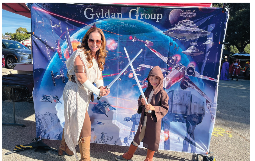
Star Wars II