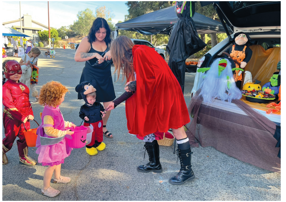
Trunk or Treat Group Photo