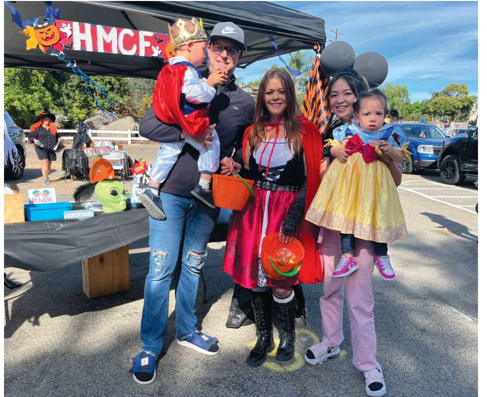
Cutest Couple – Snow White and the Prince (little brother)