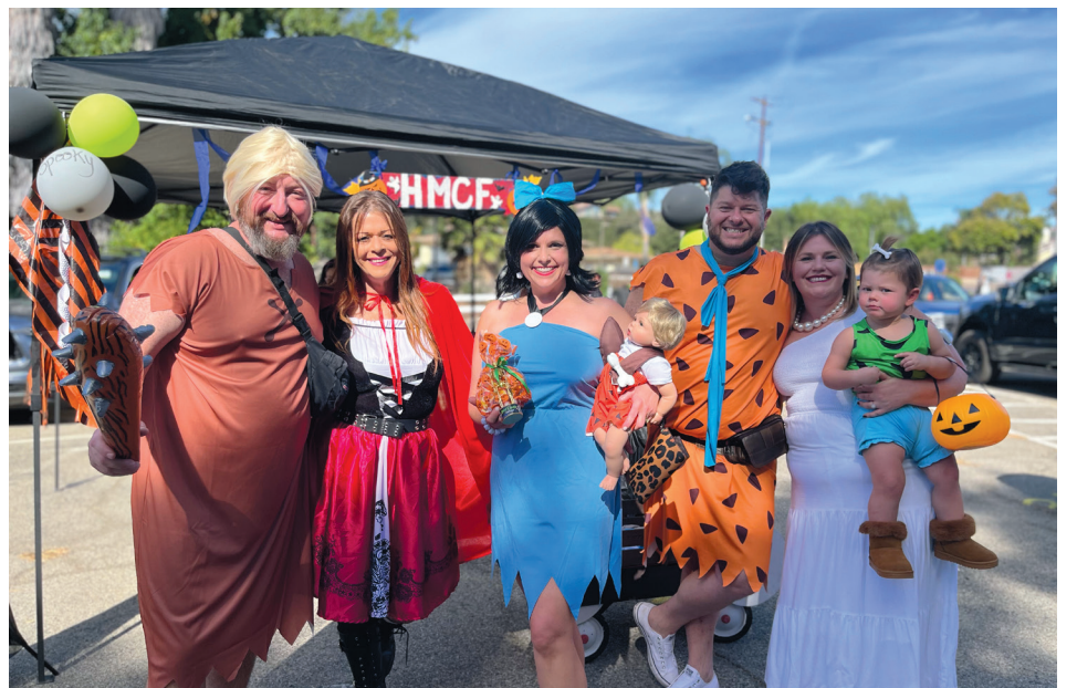
Funniest Group Costume – The Flinstones