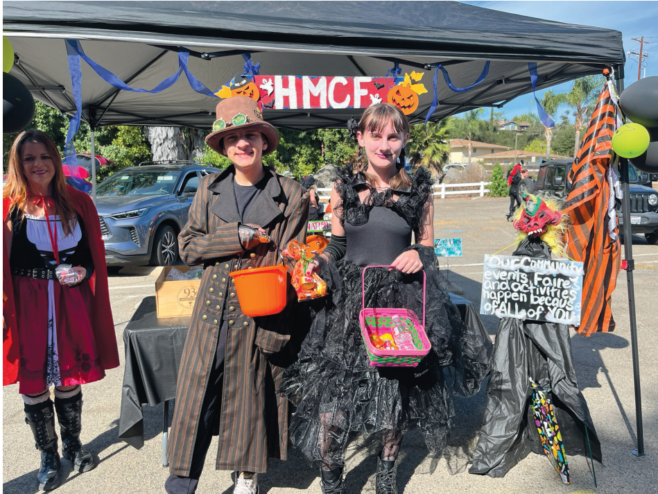
Most Original Costumes – Wednesday Adams and Steampunk Dude