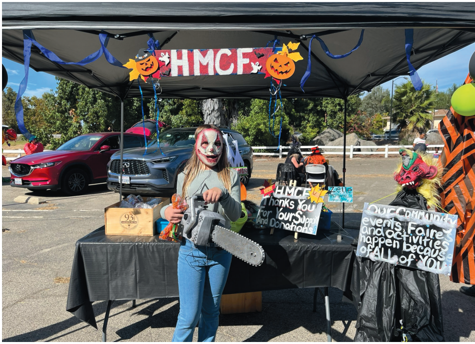
Scariest Costume – Chainsaw Girl