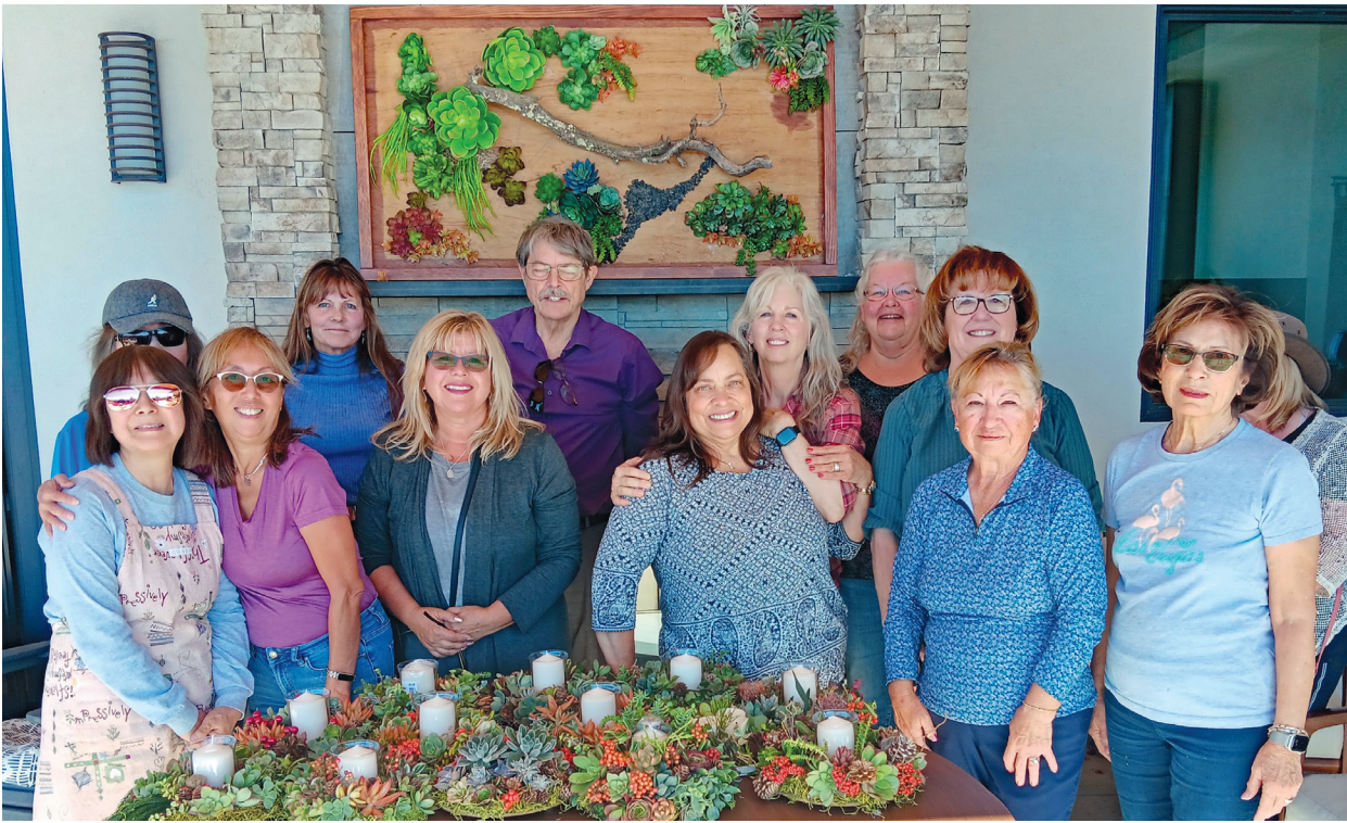
Garden Club members