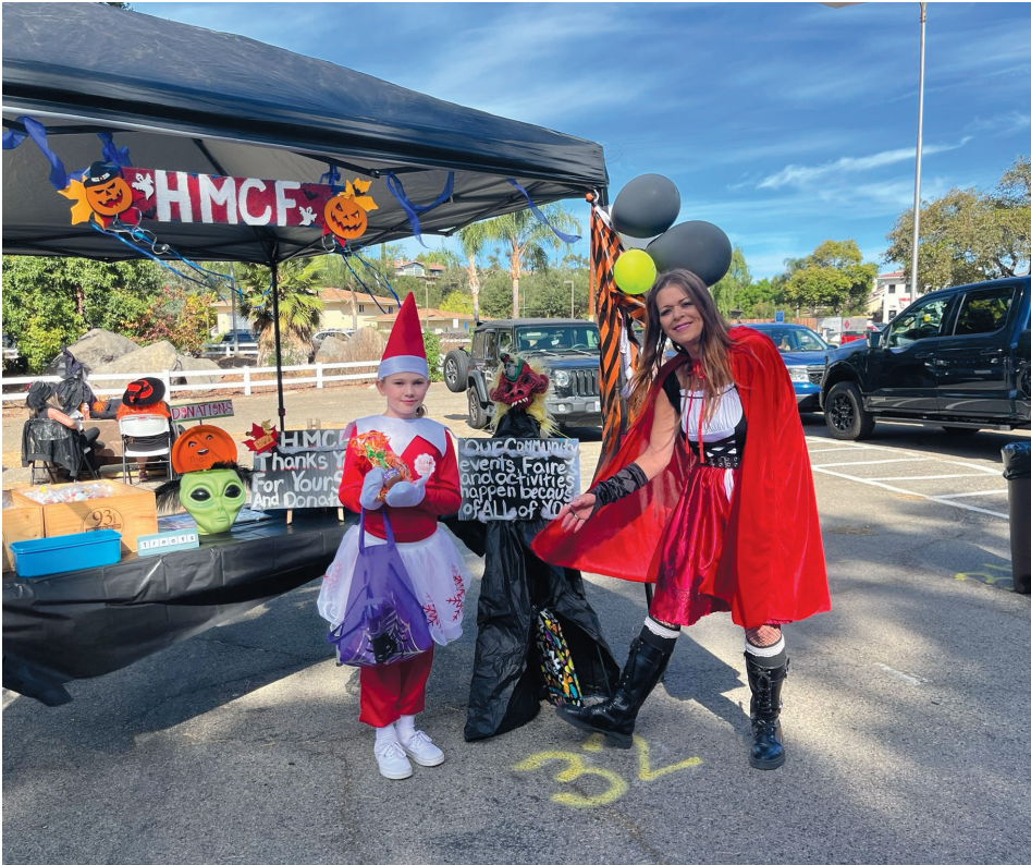
Cutest Costume – Elf on the Shelf