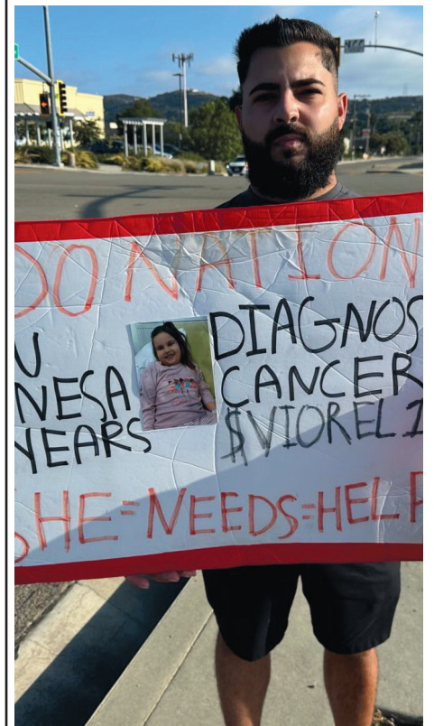
Photo taken Friday, September 15 at the Valley Center/Cole Grade intersection in Valley Center.