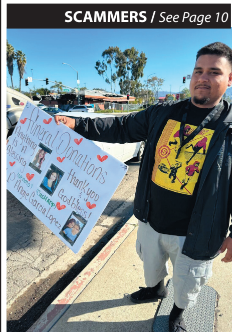
SCAMMERS / See Page 10

Update: After the paper questioned them, they all left the intersection abruptly. It's likely they'll return.