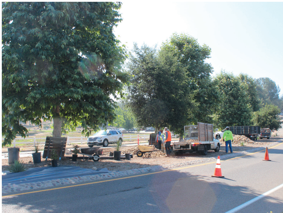
Re-landscaping the median along Mountain Meadow Road

Thanks again to all who contributed this year and for those who may have missed the solicitation but still desire to help, you can always donate by going to https://hiddenmeadows.news and clicking on the "donate" button in the upper right corner.