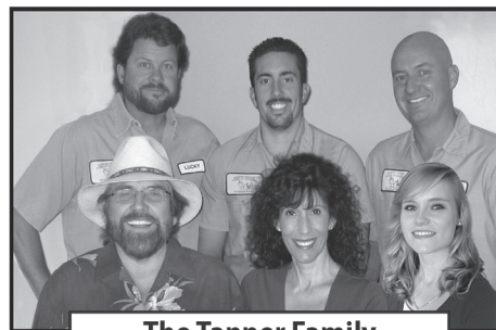
The Tanner Family Hidden Meadows Residents

Slab Leak Repair • Water Heaters Ceiling Leaks • Sewer Camera & Repair Remodels & Bath Additions Garbage Disposals Fixture Replacement & Repair Faucet & Valve Replacement & Repairs Whole House Water Filtration Systems Re-piping Water, Drain, Gas Lines Systems Pressure Regulators Thermal Expansion Issues