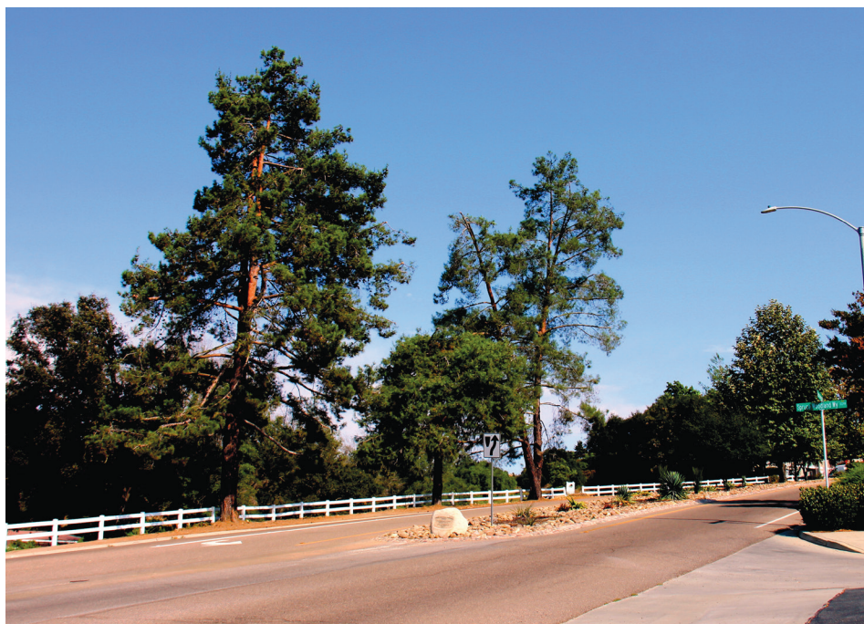
Aleppo pines along Mountain Meadow Road