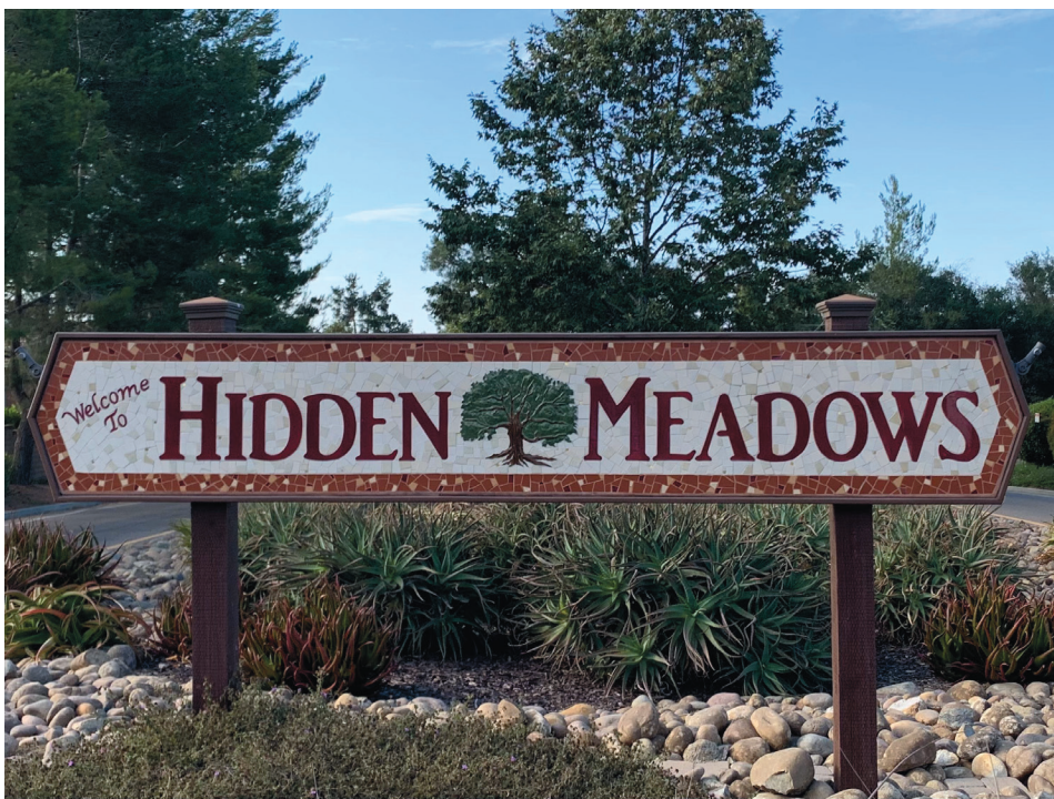
Hidden Meadows mosaic sign